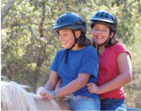
New and returning campers, alike, can count on having a great time at Camp Bloomfield.

Junior Blind's 2010 summer program at Camp Bloomfield may have ended, but the memories made there will last a lifetime. Camp Bloomfield is a magical place for