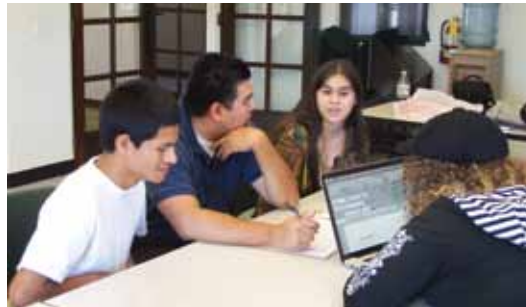
The STEP Mobile Learning Program provides blind or visually impaired students with much-needed transition workshops.

Our Mission: Helping children and adults who are blind, visually impaired or multi-disabled achieve independence.